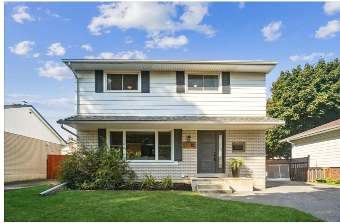
12 Morning Dew Dr. Brantford, ON N3R 3P2