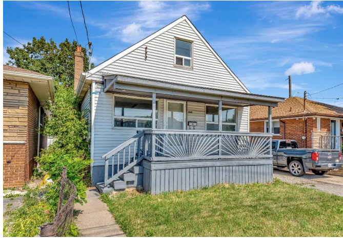
2009 Brampton St. Hamilton, ON L8H 3S8