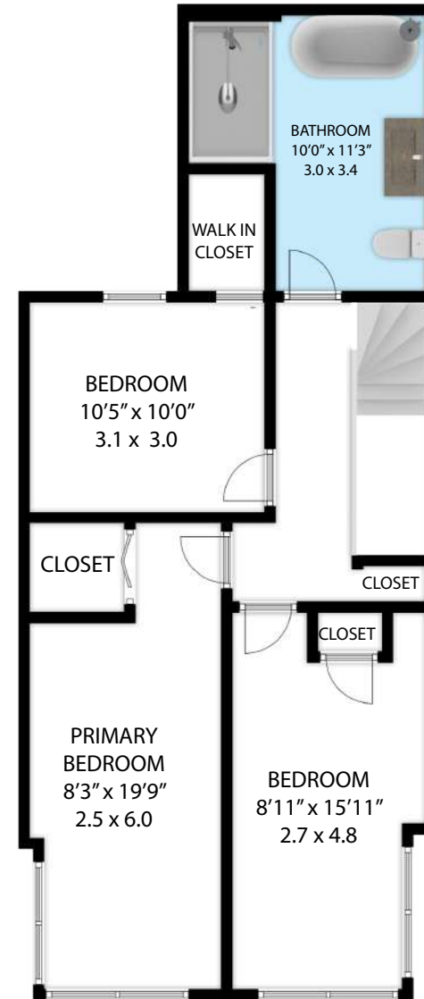
UPPER FLOOR 706 SQ.FT - 65 SQ.M

24 Norway Avenue, Hamilton L8M 2V7 TOTAL APPROX. FLOOR AREA 2,026 SQ.FT - 188 SQ.M